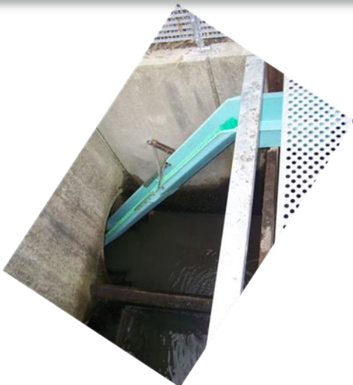
Reference : RG1